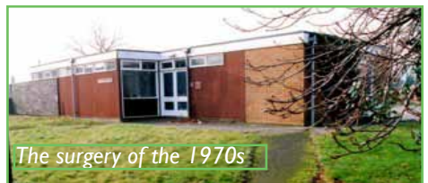
The surgery of the 1970s

This was perhaps one of the best eras for general practice. Rather than being regarded as a second-class medical service, General Practice was increasingly sought by young doctors. The development of the College of GPs which became the ‘Royal College of GPs’ in 1967 and subsequent development of the qualifications of MRCGP (membership) and compulsory formal GP training from 1981 (instead of taking up general practice with only a basic medical degree) all served to improve the recognition and standing of GPs. Yet at the time, there was little over-regulation, paperwork and fear of litigation among doctors and ‘Fundholding’ and ‘GP commissioning’ were still years away, leaving GPs to practice clinical medicine.