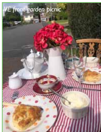
VE front garden picnic

insect friendly hotels and bee friendly plants as well as helping to review the wildlife area in St Peter's Churchyard. We are pleased that our efforts have not gone unnoticed and FODS was featured in the last issue of the Heart of England, Britain in Bloom newsletter.