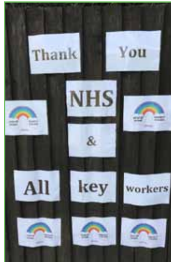
Thank you NHS and key workers

to show that we are a caring community and whilst it may be sometime before we may once again enjoy fully our pre lockdown freedom, we are sure that this new heightened emotion of caring for others is something many of us will be holding onto long after the virus has passed. Stay safe and well everyone.