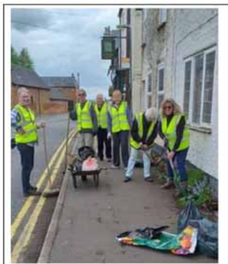
Fabulous FODS at work

FRIENDS OF DUNCHURCH SOCIETY VOLUNTEERS • FOR THE COMMUNITY • BY THE COMMUNITY Planting - Litterpickers - Public Space Care - Neighbourhood Watch - Village Magazine - Facebook - Website Village History Archive - War Memorial Care - Heritage - Dunchurch in Bloom - Members Newsletters