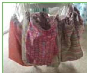
Scrub bags and ear protectors made by members of the congregation