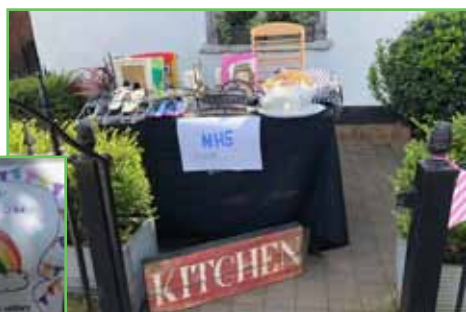
Fundraising for the NHS, and (inset) rainbows popped up around the village

magazine due to the Covid-19 outbreak. However, FODS members will have received our special update on magazine issue 7 by email or perhaps have seen it on Facebook. In this our eighth issue, we are delighted to highlight just some of the reasons we have to be proud of our community and the way we have pulled together at such a difficult time. Over the past months, we